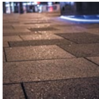
PAVERS for the FUTURE