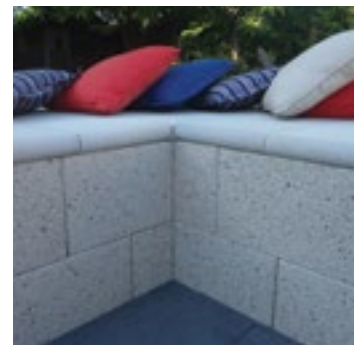
FREESTONE ECO Retaining Wall System