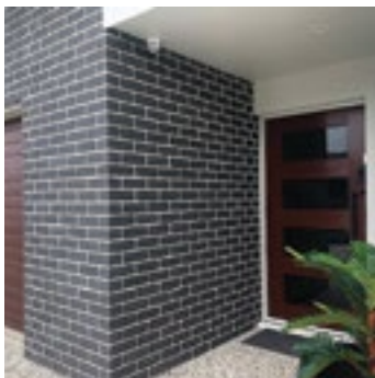
BRICKS for the FUTURE