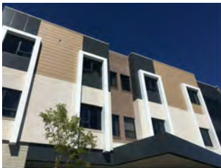
BRICKS for the FUTURE Reduce, Re-Use, Recycle