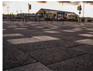
PAVERS for the FUTURE Reduce, Re-Use, Recycle