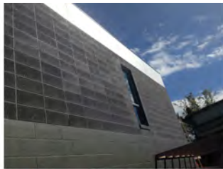
BLOCKS for the FUTURE Reduce, Re-Use, Recycle