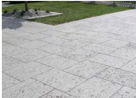
Mist Pebble Exposed Finish