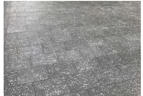
Ebony Pebble Honed Finish