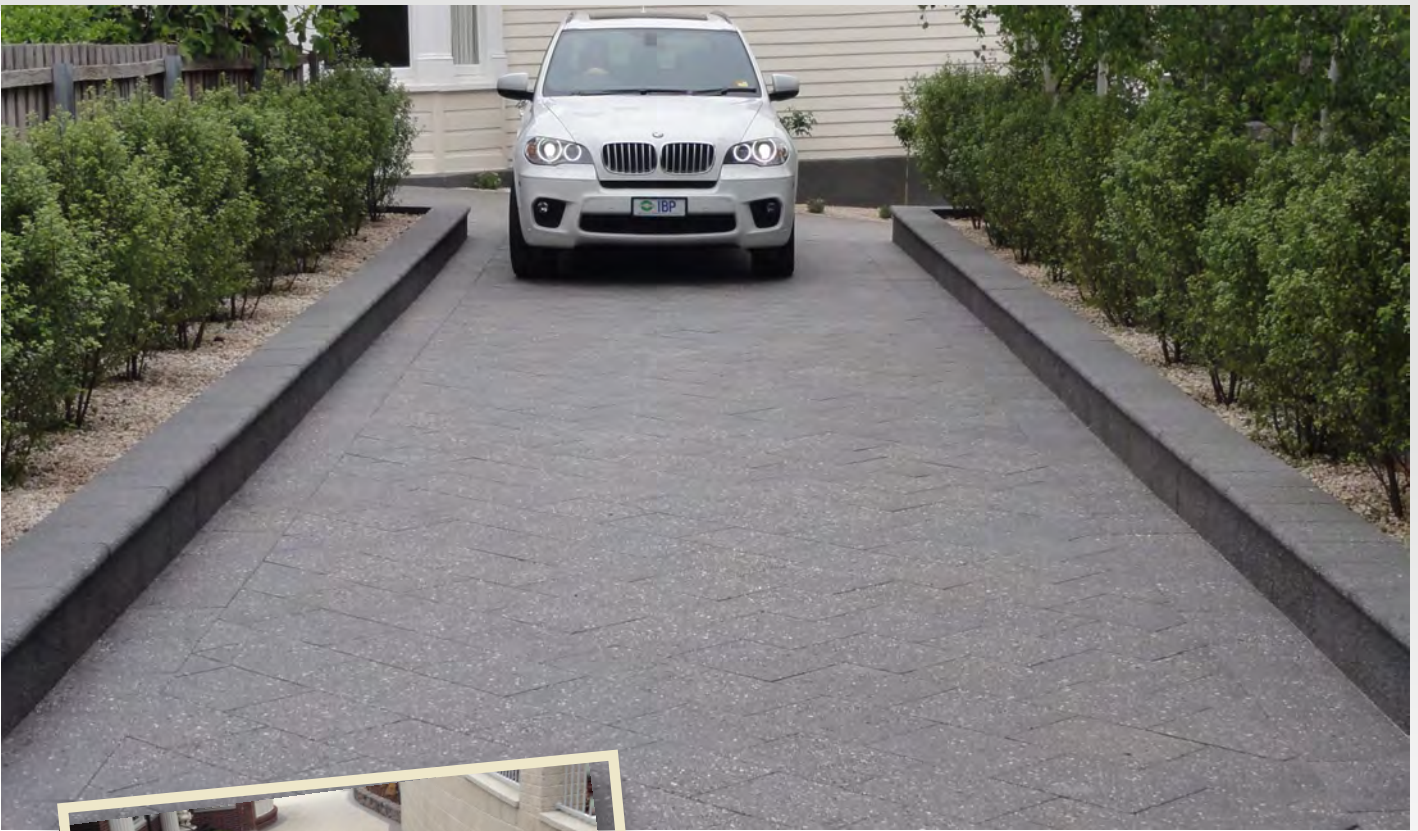
Ebony Pebble Exposed Finish

Drivestone driveway pavers are the biggest and the best exposed aggregated concrete driveway option. The large sized 400x300x65mm thick pavers contain feature pebbles and engineered glass sand which provide sensational surface finishes. The smooth, exposed and honed surface finishes available will provide you with a durable, non-slip and highly attractive driveway which will be the envy of the neighbourhood.