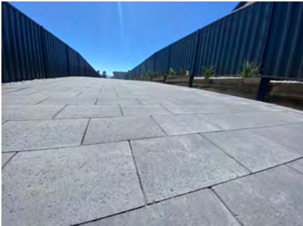
Ebony ECO Smooth Finish