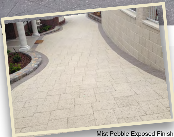
Mist Pebble Exposed Finish